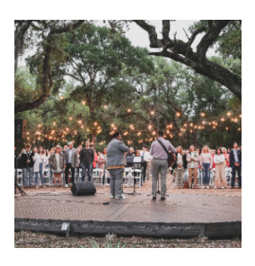
2021 We establish an outdoor venue on The Hill at PromiseLand.